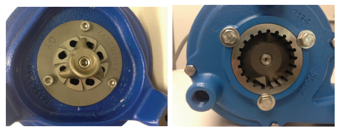
Grinders pumps work by shredding waste material into small pieces before discharging

Evolving grinder pump technology is leading to the use of alternative pump materials in the manufacturing of pumps. Traditionally, grinder pumps were constructed of cast iron and filled with oil. Manufacturers like Xylem, are looking at other highefficiency casings that are air filled because it takes less energy to spin the motor rotor in air than it does in oil.