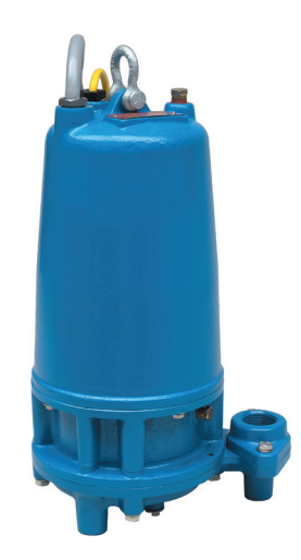
RGS2012 Residential Grinder Pump

Another industry trend is the redesign of the cutter technology using multilobe axial cutter wheels. The new design enables grinder pumps to process nontraditional amounts and sizes of waste discharge because the multilobe axial cutter wheels chop the waste materials into extremely small pieces.